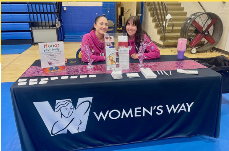
(Above) WPPH staff participated in a number of community outreach events including the Standing Rock Community Fair in October 2025.

WPPH focuses on building strong relationships, sharing resources, strengthening policies and processes, and delivering clear communication that educates and empowers communities.