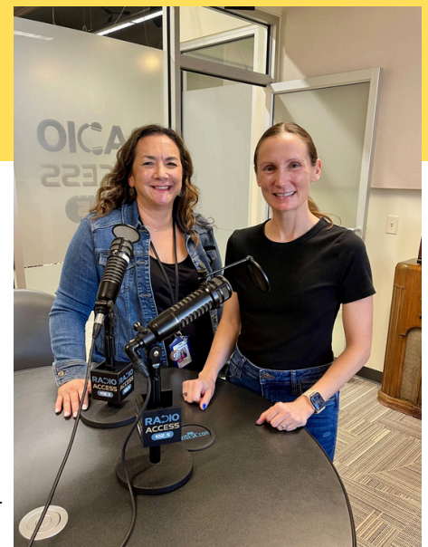
(Right) WPPH, in partnership with Dakota Media Access, launched the Public Health Matters podcast in July 2025.

To learn more: westernplainsph.org/public-health-matters-podcast