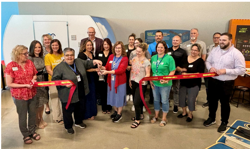
(Above) Dedication of the lactation pod at ND's Gateway to Science.