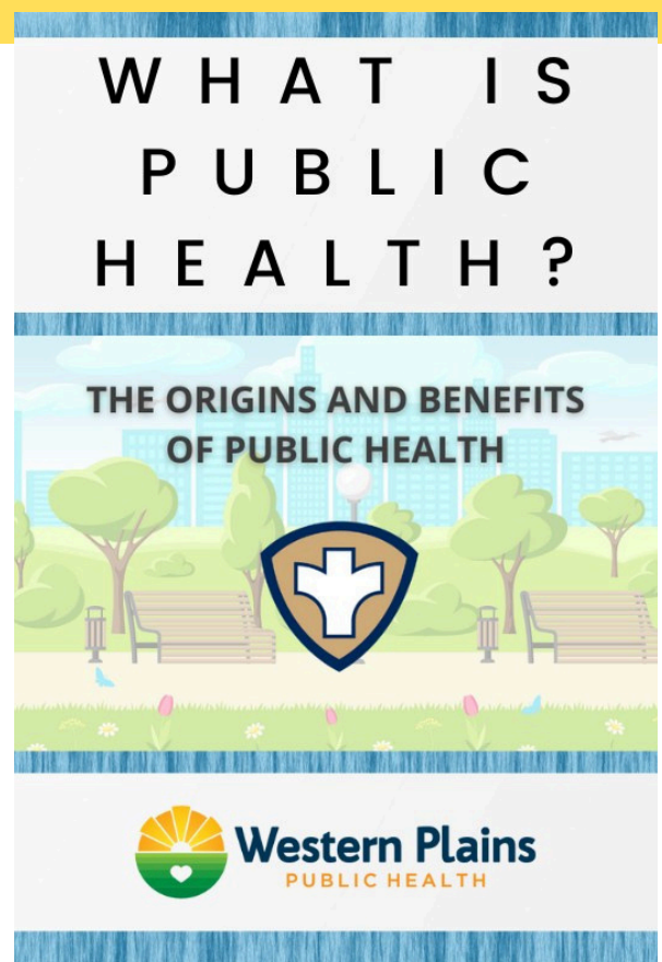
(Right) WPPH finalized five videos highlighting public health benefits and programs.