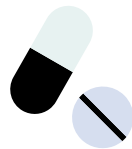
One Rx Program